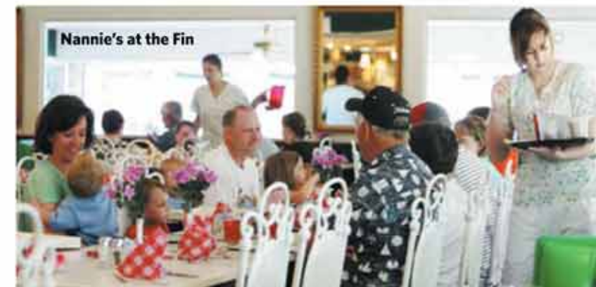
Nannie's at the Fin

Oliver's Twist — at least the one on Grand Lake — is accessible by boat and car.