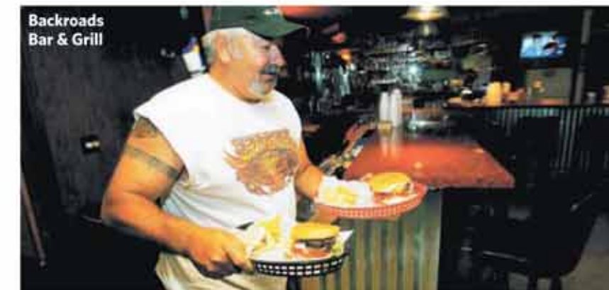
Backroads Bar &amp; Grill