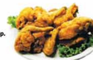
Fried chicken from The Chicken Coop.